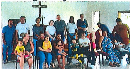
Families with children with disabilities pose for a picture in El Buen Pastor Lutheran Church

Thanks be to God through Jesus Christ for the joyful work He is doing in Belize!